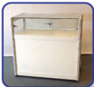
S3 - Low glass showcase (103L x 53W x 103cm.H.)