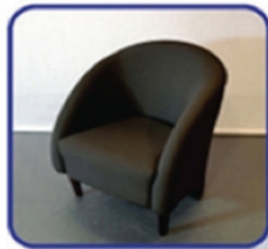
SOA1 - Sofa seat black color