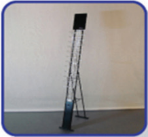
B6 - Brochure rack metal black