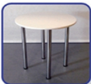
T5 - Round table (white) ( 70 cm dia. x 72 cm.H.)