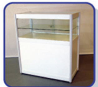
S3b - Glass showcase (103L x 53W x 123cm.H.)