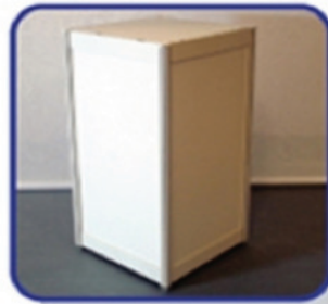
S6a - Display cube ( 53 x 53 x 103 cm.H.)