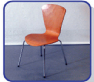
C10 - Beechwood chair