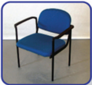
C6 - Stackable chair blue fabric