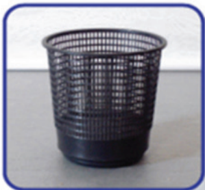
FA2 - Waste paper basket plastic