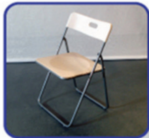
C8 - Folding chair white