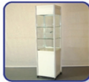
S8a - Tall glass showcase ( 53 L x 53 W x 205 cm.H.)