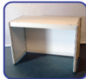
S1a - Info counter (103L x 53W x 79cm.H.)