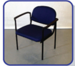
C5 - Stackable chair black fabric