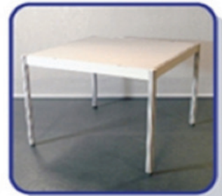
S7 - Square table ( 103 x 103 x 79 cm.H.)