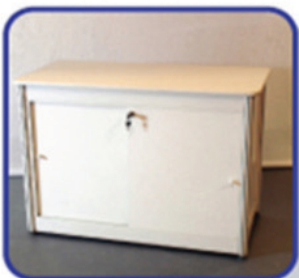
S2 - Lockable cabinet (107.5L x 56.5W x 80cm.H.)