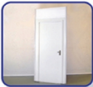
S10 - Swing door