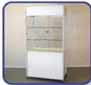
S8 - Tall glass showcase ( 103 L x 53 W x 205 cm.H.)