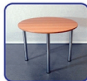
T7 - Round table (beechwood) ( 90 cm dia. x 72 cm.H.)