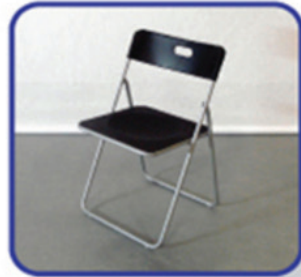
C8a - Folding chair black