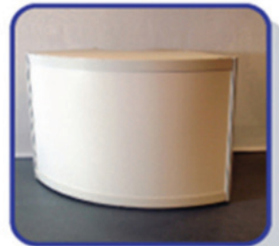
S1b - Info counter curve (144L x 67W x 103cm.H.)