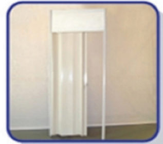
S9 - Folding door