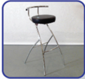
BS1 - Bar stool black