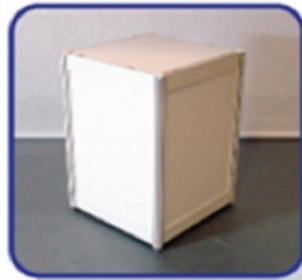
S6 - Display cube ( 53 x 53 x 79 cm.H.)