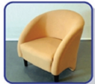
SOA3 - Sofa seat beige color