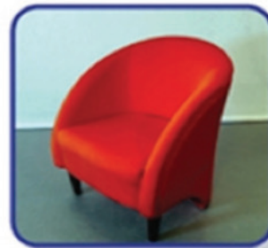
SOA2 - Sofa seat red color