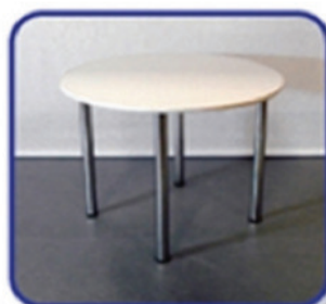
T6 - Round table (white) ( 90 cm dia. x 72 cm.H.)