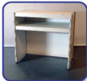
S1 - Info counter (103L x 53W x 103cm.H.)