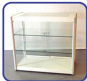
S3a - Full glass showcase (103L x 53W x 103cm.H.)