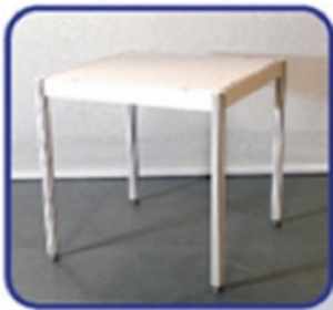
S7a - Square table ( 74 x 74 x 79 cm.H.)